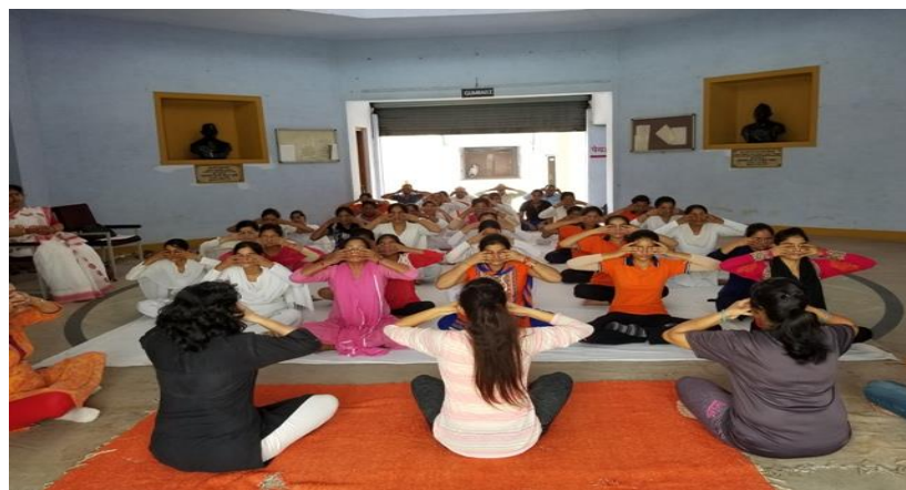
International Yoga Day 21 st June 2018 with the students