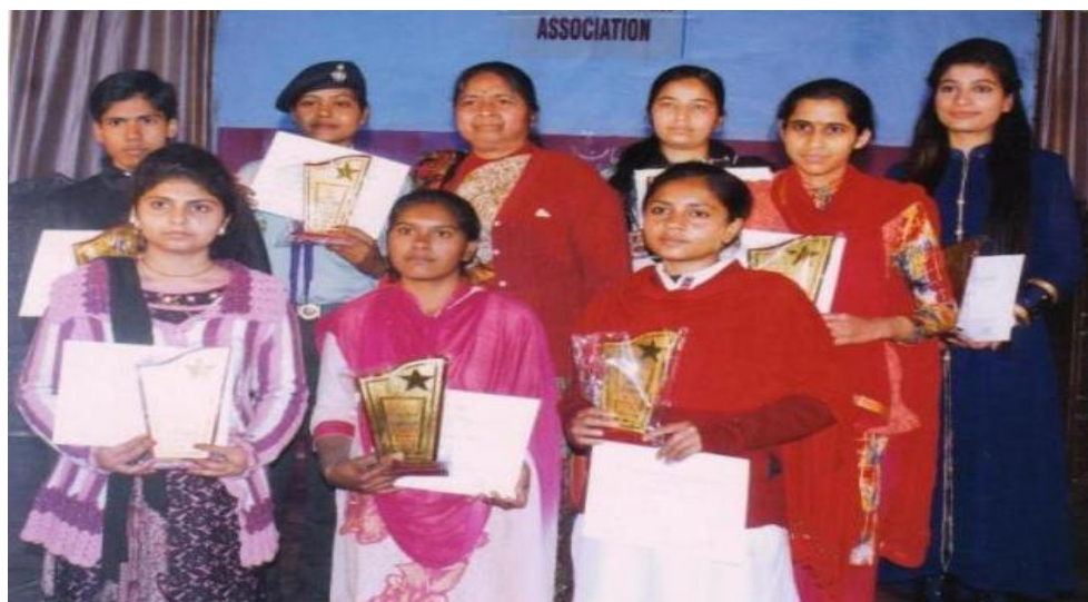
Toppers & Best students in different activities awarded in annual prize distribution Feb 2018