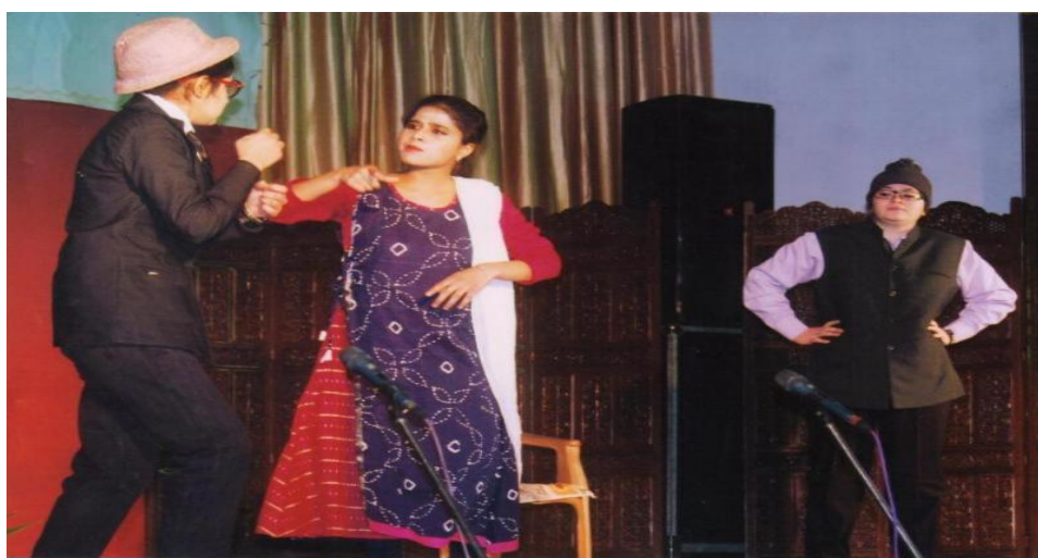
Drama Performance by the students of English Communication Skills.(ELA Function Feb 2018)