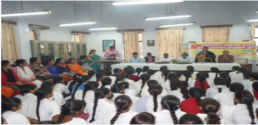
Nagarayukt lecture On 8 Nov 2017