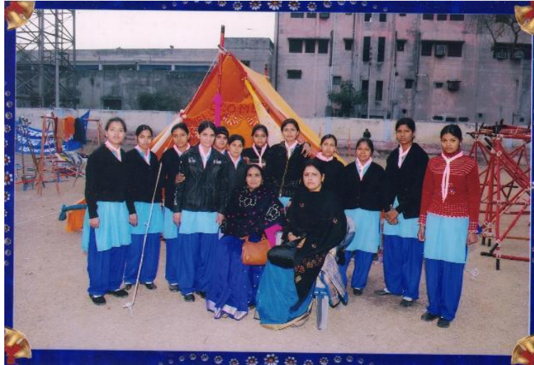
Three-day Pravesh/Praveen Ranger camp organised in Feb 2018