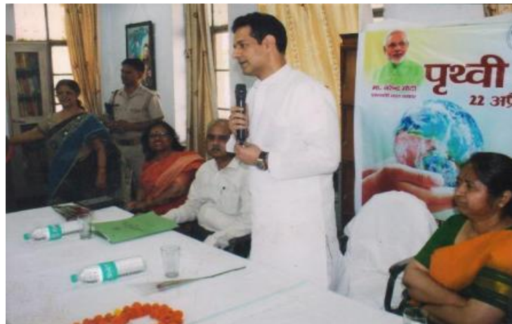
Member of Parliament, Sh. Raghav Lakhanpal in Earth Day Programme on 22 nd April 2018