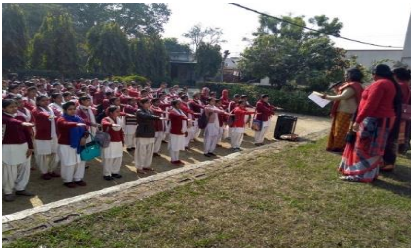
Students taking oath for vote in the assembly