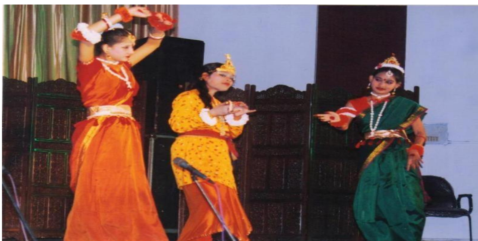
Dance on Geet Govind Ashtpadi by students of English Dept.(ELA Function Feb 2018)