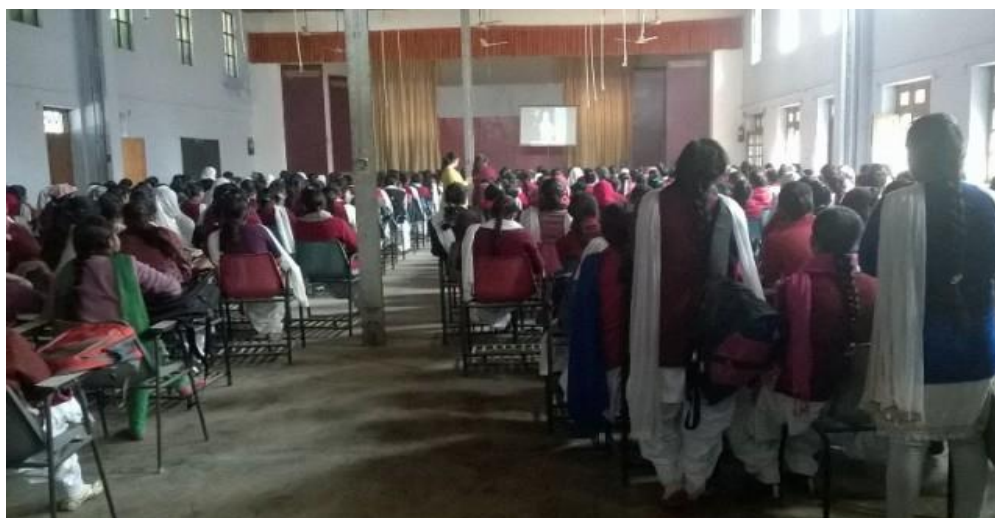
Mann ki baat programme of Prime Minister sh. Narendra Modi in college auditorium