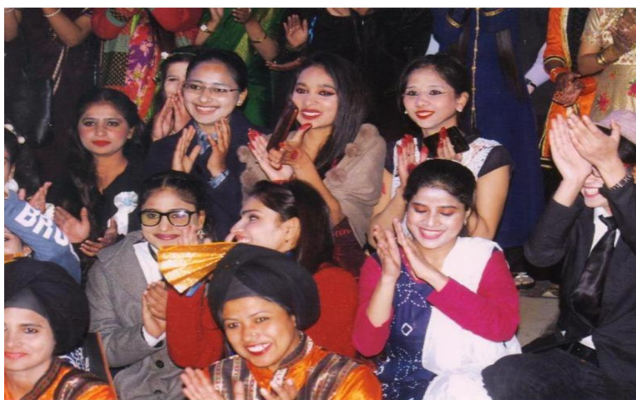
Students cheering in the ELA Function