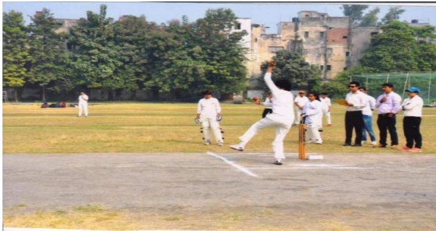
CCS University Intercollegiate Cricket (w) trial 2017-18